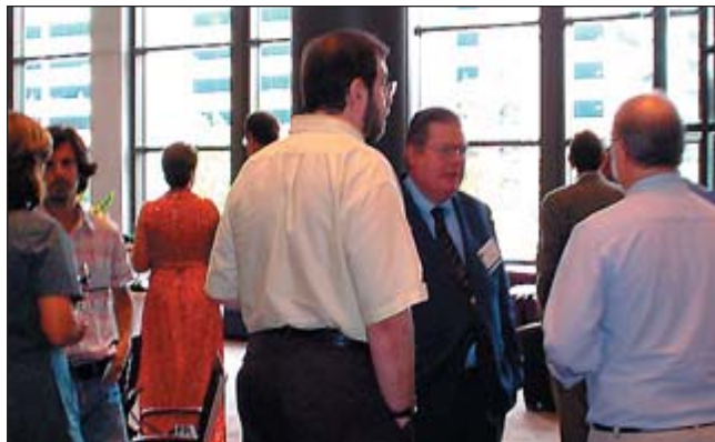
New faculty of the University Heights institutions mingle at a reception held August 31, 2005 at Albany Law School

UHA continues to pursue opportunities which can provide a forum for collaborations beneficial to its institutions and the community. These collaborations focus on partnerships amongst the institutions and neighborhoods. Such is the case with the recently announced Employer Assisted Housing Program, as discussed in detail in this newsletter. Sometimes, the collaborations are geared specifically to benefit our institutions, as in the retirement series of seminars we are hosting this academic year. In October we presented a seminar on Living Wills and Health Care Proxies. Throughout the year, we will host seminars on such topics as long-term planning for those retiring in 15 or more years as well as legal issues retirees may face. We are proud to be part of these initiatives.